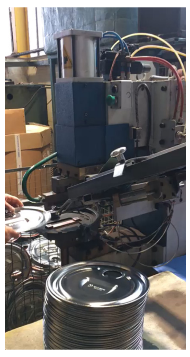
Figure 2: A spot welding machine used to weld handles on to metal lids.

The VisNet® Hub will provide LV network operators the visibility required to manage and understand situations like these. If you would like to know more about the VisNet® Hub and its many capabilities, please click here.